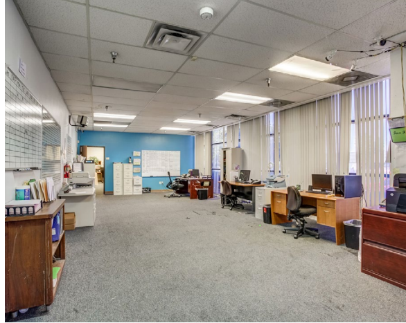
Open Office Space