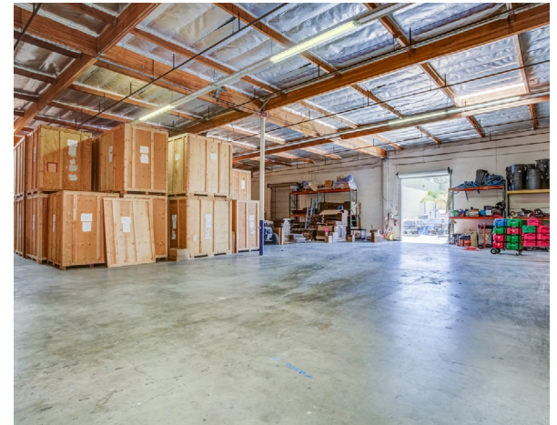
Grade Level Door (10'x14')